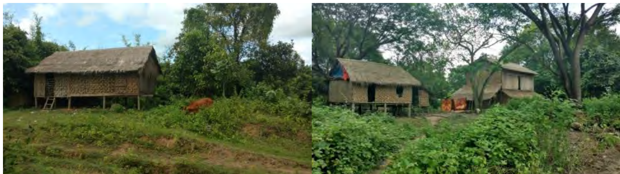
Examples of structures on village settlement land in San Gyi

The use of taungya land varies from village to village. In San Gyi, Bant Bway Gone, and Yway Gone, residents used to practice hillside farming on taungya lands, but as this land has become less available, the practice has mostly stopped. In Heingyu, the residents still practice a mix of shifting cultivation and agroforestry on taungya lands, growing teak, paddy, chili, and sesame. As with agricultural land, women and men cultivate taungya land together, splitting the responsibility for most tasks. Men more commonly take primary responsibility for clearing taungya land and plowing the fields. As with kitchen gardens on village settlement land, women tend to take primary responsibility for the kitchen gardens on the taungya land.