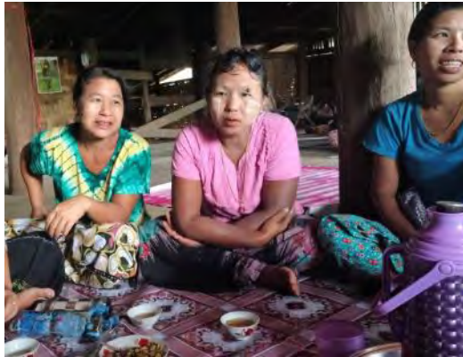
Focus group discussions in San Gyi

that had relocated will generally go back to his or her natal village, regardless of gender. Respondents said that person would have rights to land within his or her natal village, as if he or she had never left. As the research team asked about more complicated situations, such as a couple from the same village or a couple with children, the respondents were unsure as to what would happen. Some thought that the land should be split 50/50. Others thought it depended on which family the land came to the couple from, or whose fault the separation was. Still others thought where there were children involved, there should be a presumption in favor of the woman keeping more of the land.