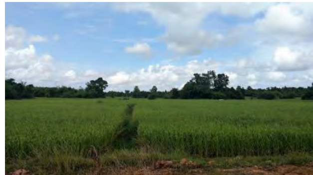
Agricultural land in San Gyi

In all of the villages, it was the village leader who facilitated the registration process. The women in the focus groups reported that the village leader had come to the men in the family to gather the information to get the Form 7. The women in the family were not generally part of the process, although the women from households with a Form 7 had some knowledge of the requirements and the length of the process (they reported that it varied in length from two to six months). Women from households that do not have a Form 7 had little knowledge about the form itself or the process to obtain it.