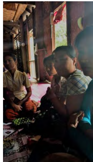
Focus group discussions in San Gyi

Respondents said that on occasion, villagers may go directly to DoALMS or the Forestry Department with a land-related problem, although it is usually the village leader who interacts with these officials. The villagers reported that it is only men who interact with government officials.