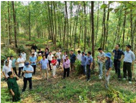
The Project organized a visit to a Forest Stewardship Council (FSC) certified forest.

“The Huong Xuan Cooperative has received a lot of support from the Project through technical assistance, such as capacity building (trainings), product development and improvement (shampoo and soap), and market access. Thanks to these activities, I have become more confident in production and business to create more jobs and incomes for local people. Revenue from the cooperative has also increased by about 100% compared to before Project support.”