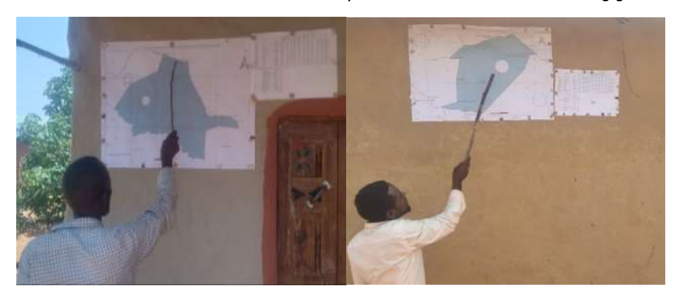
Fig.4: Maps and textual information displayed for public opinion in Sawena (left) and Raitu (right) Woredas.

The final step in the registration process is publicly displaying the validated maps and textual data in locations accessible to the wider community for comments and feedback. LGA engaged