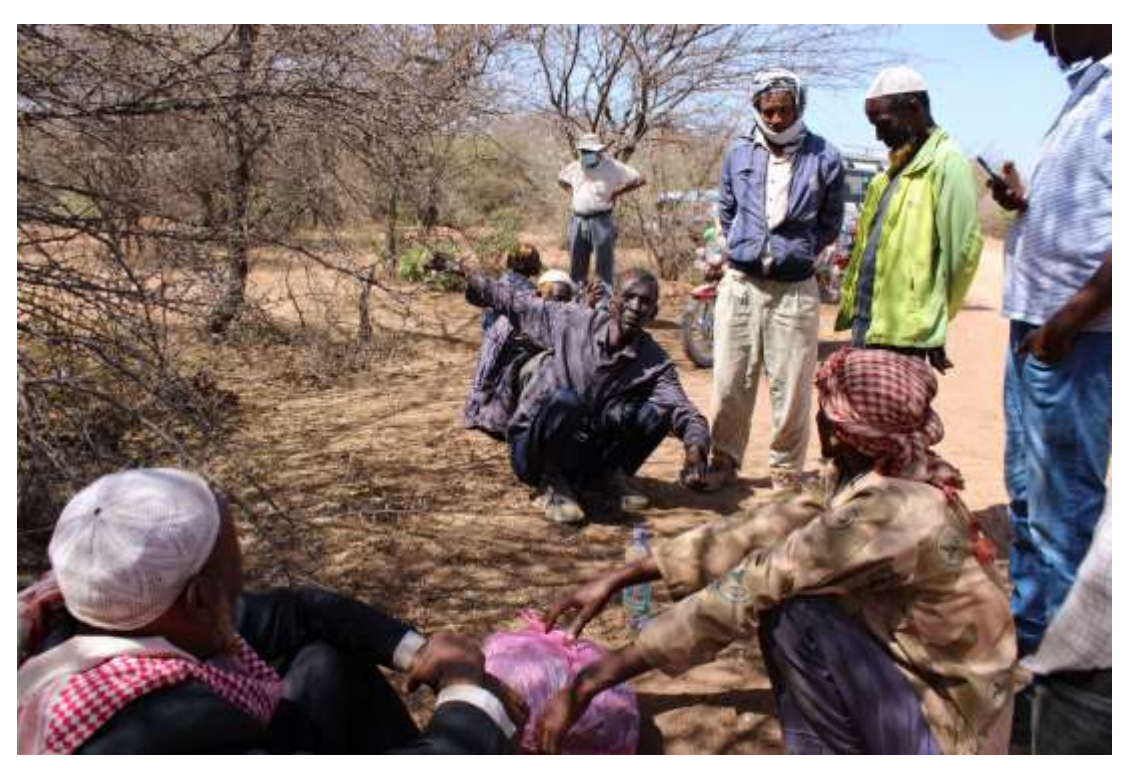
Fig.2: PLAC members negotiating a boundary point in Sawena Woreda